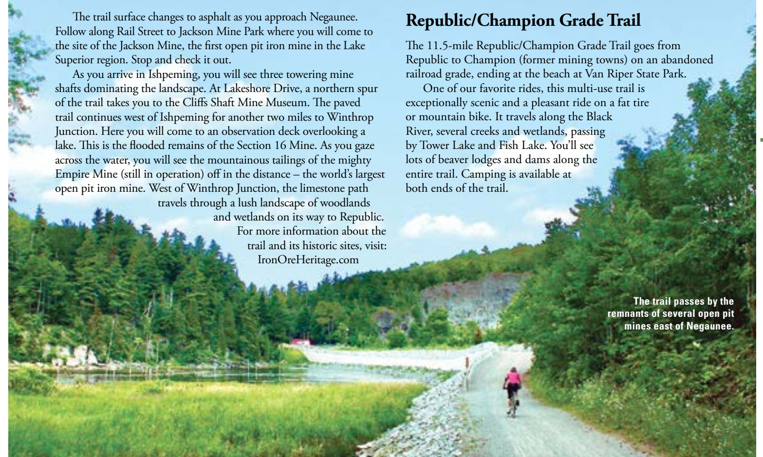
The trail passes by the remnants of several open pit mines east of Negaunee.

The 11.5-mile Republic/Champion Grade Trail goes from Republic to Champion (former mining towns) on an abandoned railroad grade, ending at the beach at Van Riper State Park. One of our favorite rides, this multi-use trail is exceptionally scenic and a pleasant ride on a fat tire or mountain bike. It travels along the Black River, several creeks and wetlands, passing by Tower Lake and Fish Lake. You'll see lots of beaver lodges and dams along the entire trail. Camping is available at both ends of the trail.