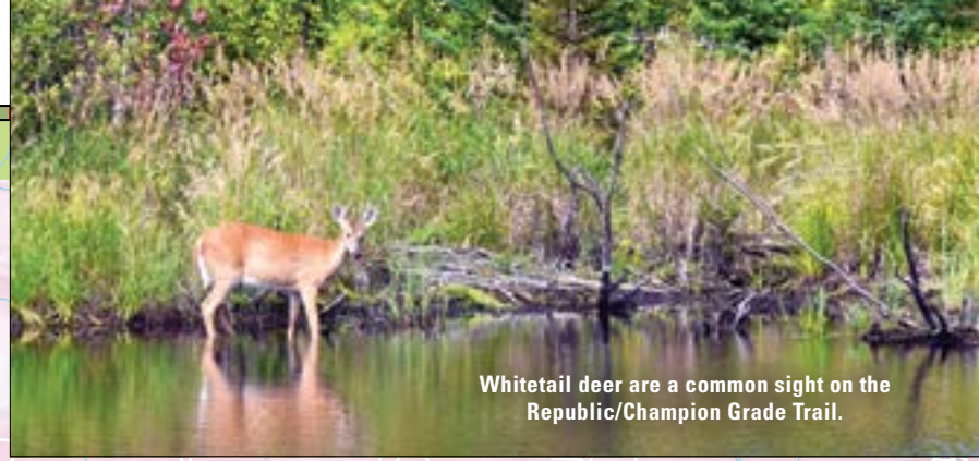
Whitetail deer are a common sight on the Republic/Champion Grade Trail.